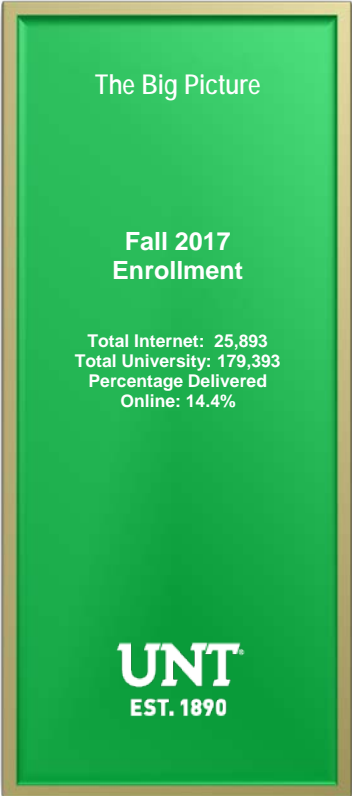
Exhibit G-8 Fall 2017 - Internet Enrollments (INET) (Undergraduate & Graduate Combined)